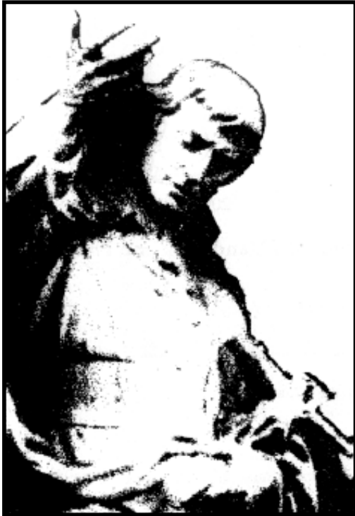
St. Louis Marie de Montfort