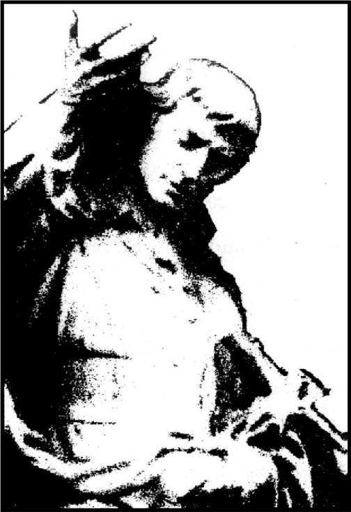
St. Louis Marie de Montfort