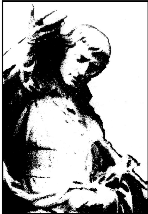
St. Louis Marie de Montfort